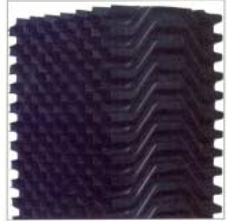
12" Wide x 11" Deep Packs